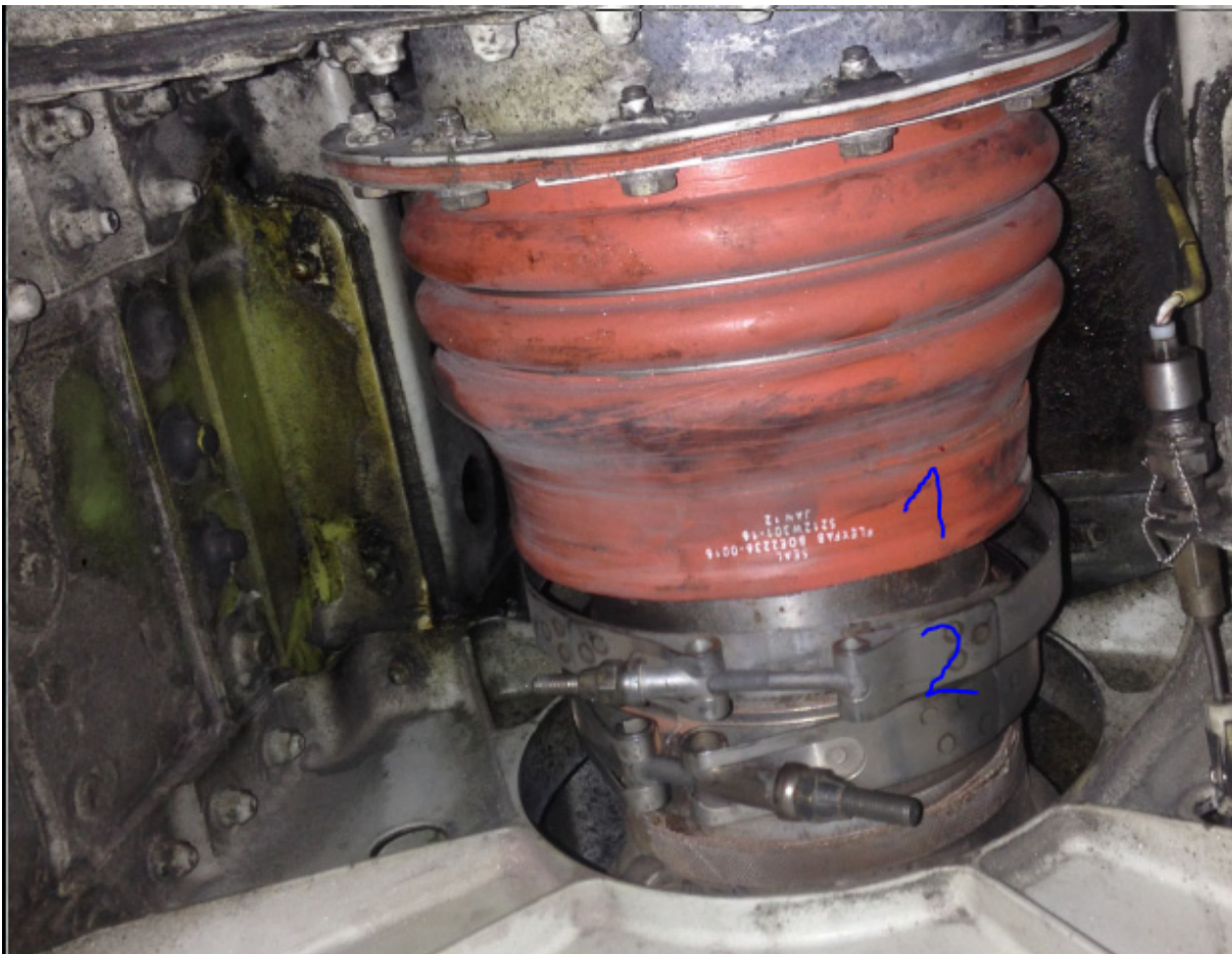
Bulk seal including loose clamp

The following photo shows the loose clamp in position 2 which should have been above the bulk seal in position 1.