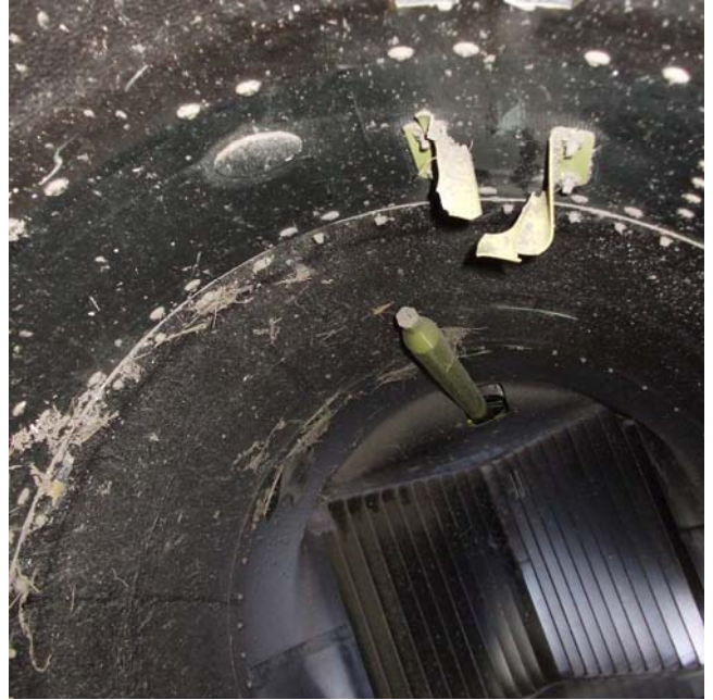
Image of the damage at the accident helicopter, view from the front to the rear towards the control rod for thruster adjustment