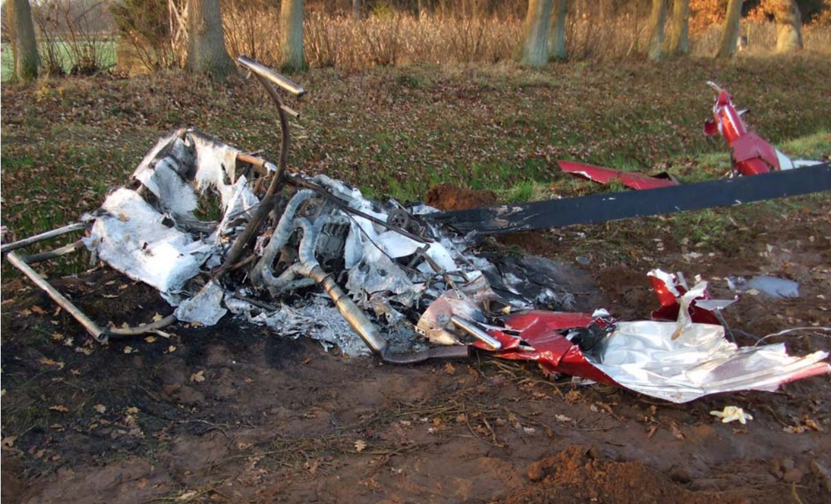
General view of the burned out helicopter