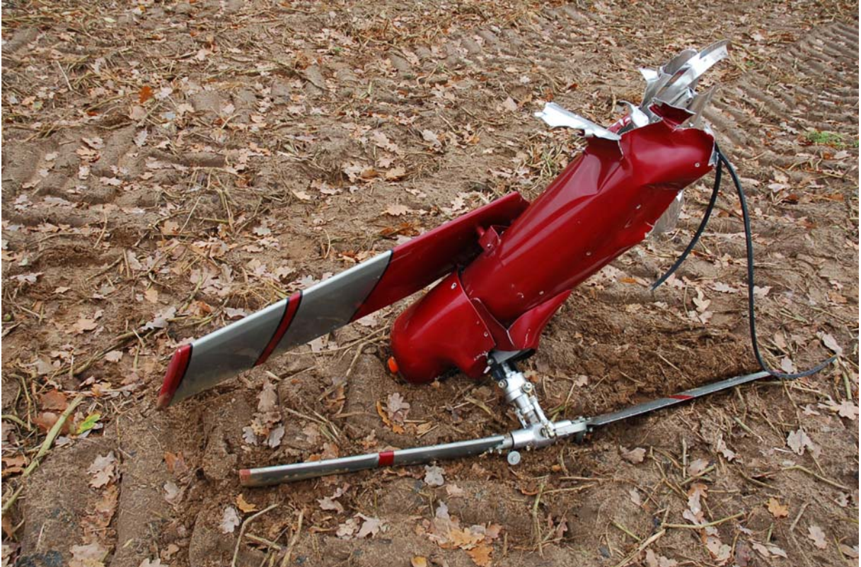
Separated tail boom with tail rotor and drive belt