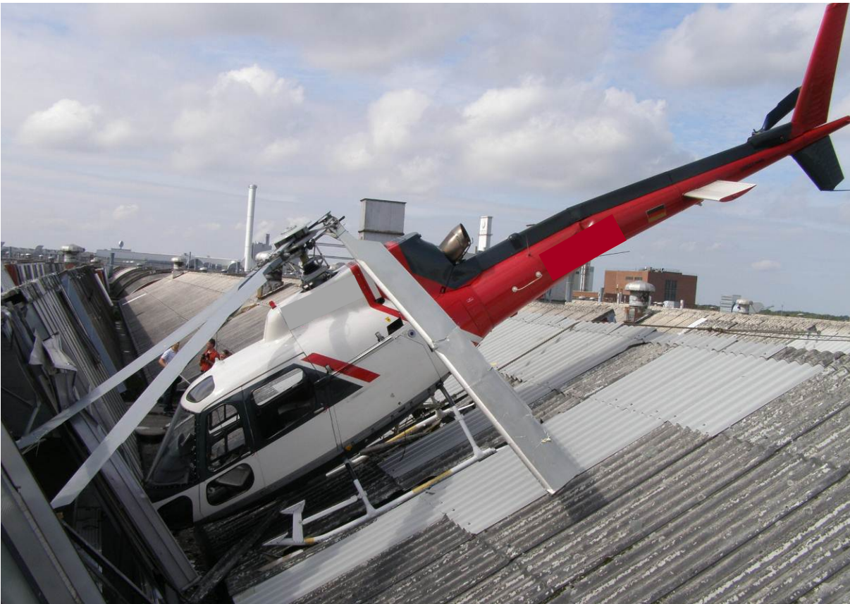
Accident site overview