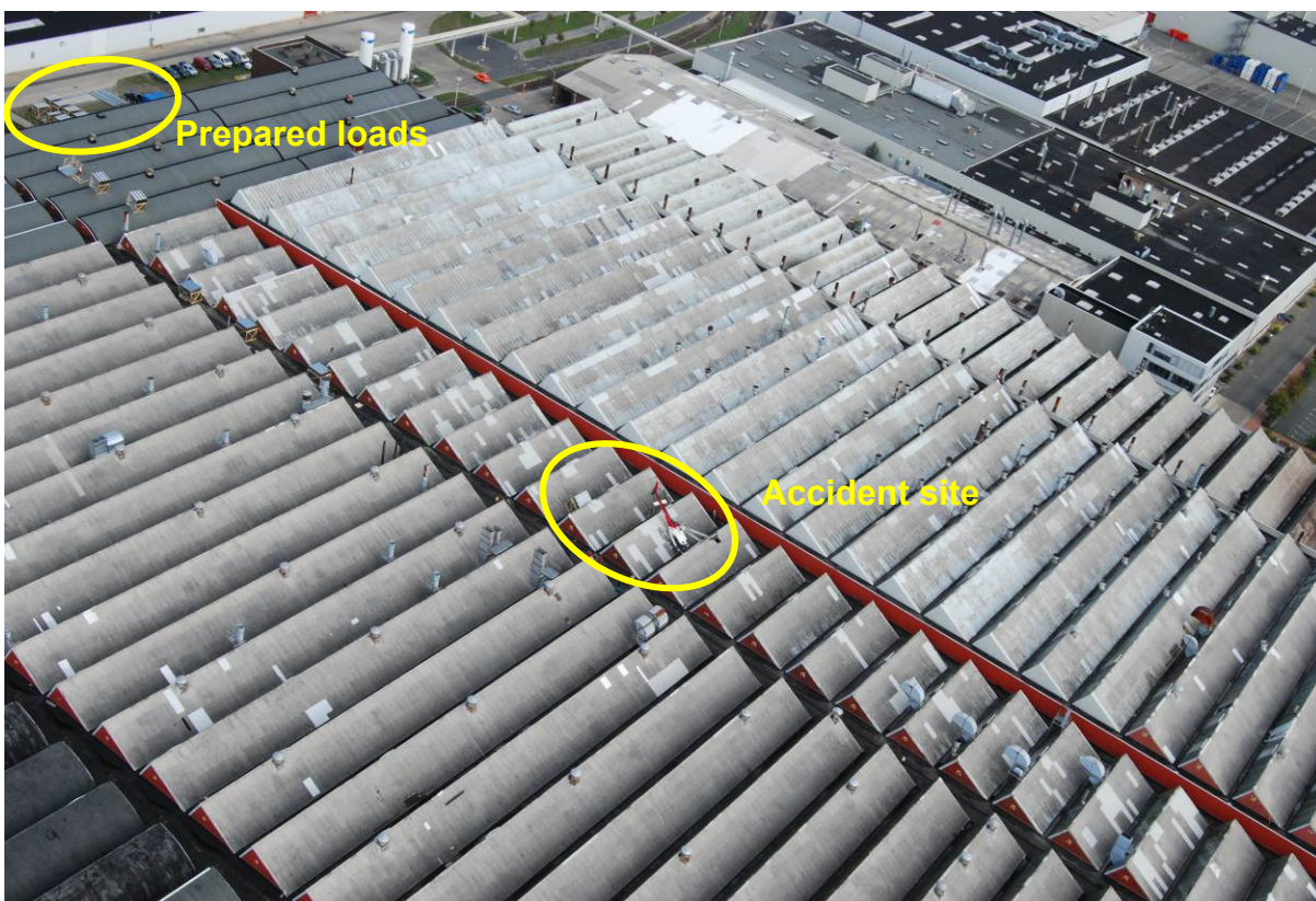
Overview pick-up location, drop area and accident site on the shed roof

On the day of the accident, the pilot conducted several transport flights with a helicopter AS350 B2 and external loads. The external loads were prepared for transport next to a factory workshop and were to be transported to the roof of a hall. The distance between preparation area and hall was only a few hundred meters. After a flight time of about 55 minutes and nine successfully conducted transport flights a load of about 790 kg was to be transported to the roof before breaking to re-fuel. At about 1145 hrs 1 an engine failure occurred on the way to the roof. The pilot lowered the helicopter onto the pitched roof area of the shed roof using hover-autorotation. The helicopter was severely damaged and the roof also suffered damage.