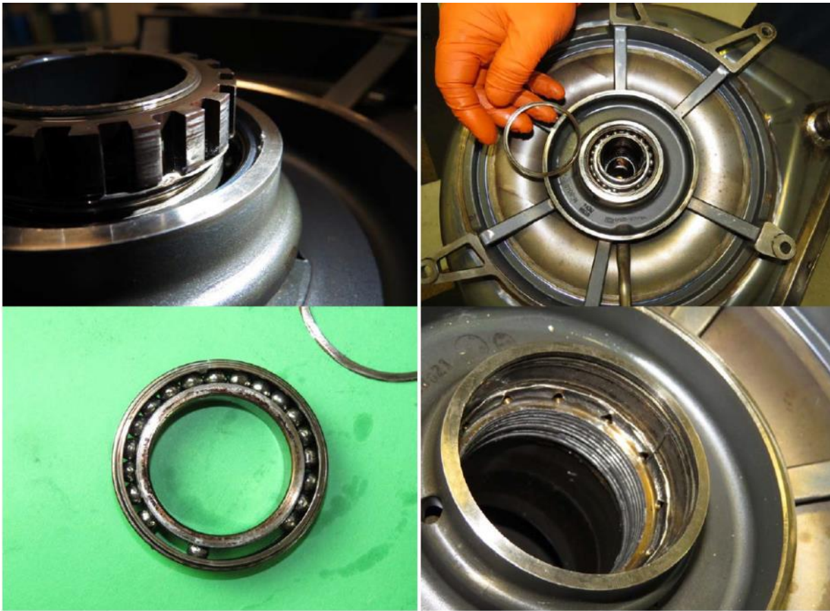
The No 5 bearing at the time of the engine disassembly