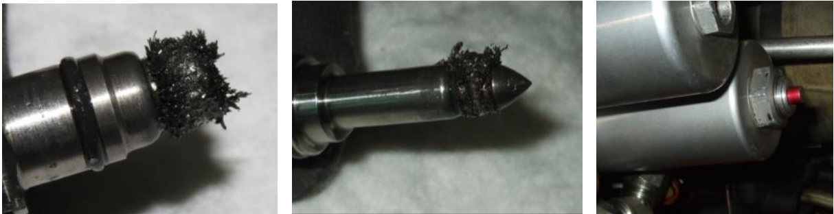
Metal chips in the engine oil circulation

After the helicopter had been salvaged the engine was examined in the presence of an expert of the engine manufacturer. It was determined that the engine was still mounted correctly and did not show any external damage. All air pressure, oil, and fuel pipes seemed to be undamaged and without leakages. The compressor did not show any foreign object damages. The N1 and N2 power train could manually be turned and power transmission was possible. In the N2 power train strong friction and grinding noises were observed. The examination of the two chip detectors revealed numerous metal chips. The bypass-pop-out of the oil filter at the engine had also been triggered.