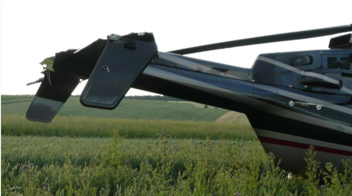
Damaged tail of the helicopter

All four main rotor blades and the rotor head were damaged. The tail boom had been severed abeam of the horizontal stabilizer. The outer vertical fins had been severed above the horizontal stabilizer. The vertical fin together with the tail rotor including the fractured tail rotor gear box were found in the field south-east of the helicopter. The aft crosstubes of the skids were bent outwards.