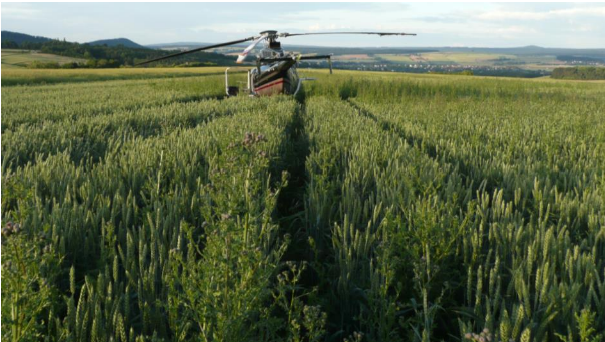
Overview accident site