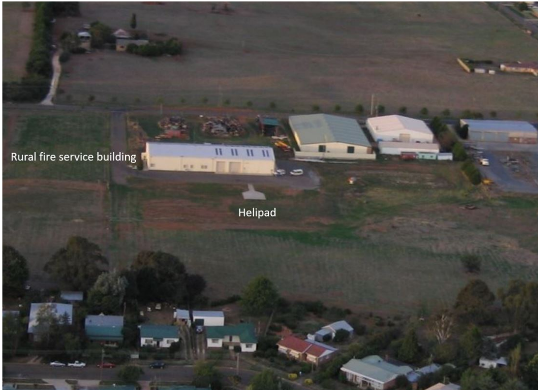
Figure 4: Crookwell Medical helicopter landing site