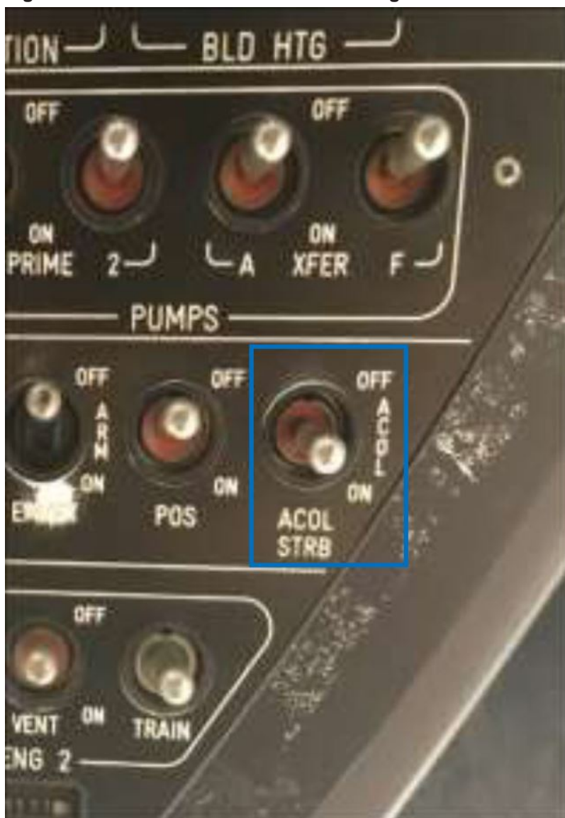
Figure 2: VH-SYB’s anti-collision / strobe light switch