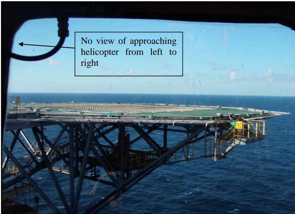
The helicopter approached from left and behind the office building giving no visual references to the crane operator.