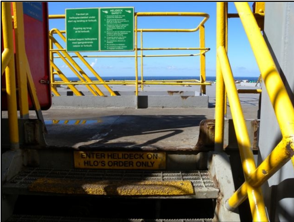
No visual references of crane or approaching helicopter.