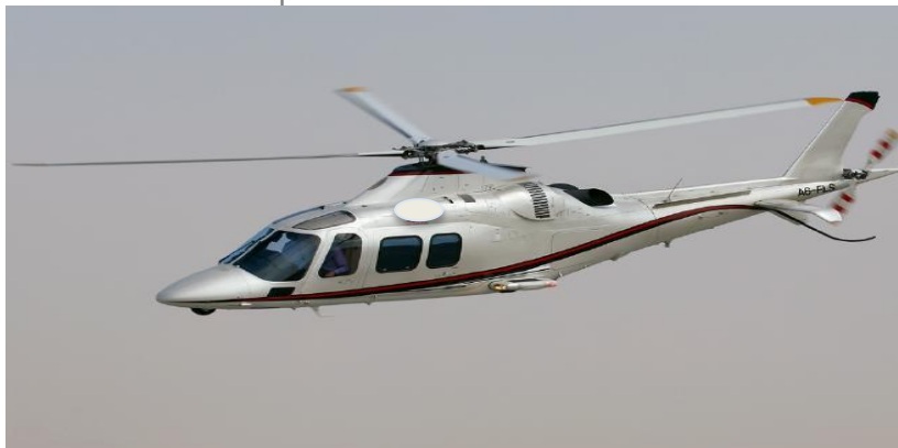
Figure 3. The Occurrence helicopter 6

All of the above inspections referenced additional work sheet number 9306 carried out by an Operator's approved engineer. The mass and center of gravity of the Helicopter were within the prescribed limits.