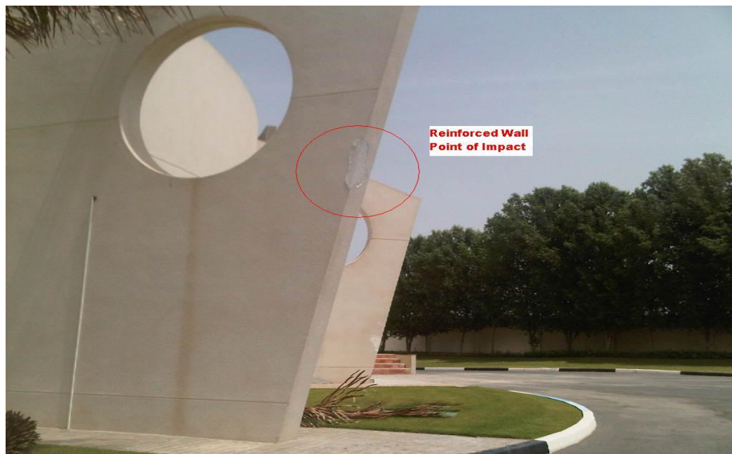
Figure 2 Point of contact of the main rotor blades with the reinforced wall

The pilot stated that a clear plastic, most probably a bag from a nearby construction site, “ came close to the aircraft main rotor ”, and distracted him. He stated that he “ moved to avoid ” the FOD. He also stated that the wall angle gave him a false sense of clearance at eye level (see figure 2).