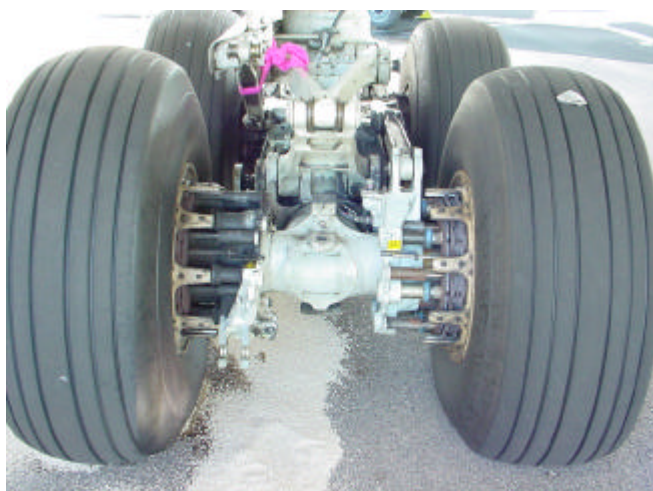
The broken lug (bottom left) of the right MLG

One witness stated that during the acceleration phase of the take-off he had noticed a blowpipe flame from the exhaust cone of engine #1 twice, followed by a bang. Another witness noticed one blowpipe flame during the acceleration phase and two white plumes of smoke originating from the tires after the take-off had been rejected. When the aircraft taxied from the runway air traffic control instructed the flight crew to hold the aircraft because of smoke development and some flames near the right main landing gear (MLG). The crew stopped the aircraft and the engines were shut down. The airport fire fighting services were on standby to keep the situation under control. No crew members or passengers got injured.