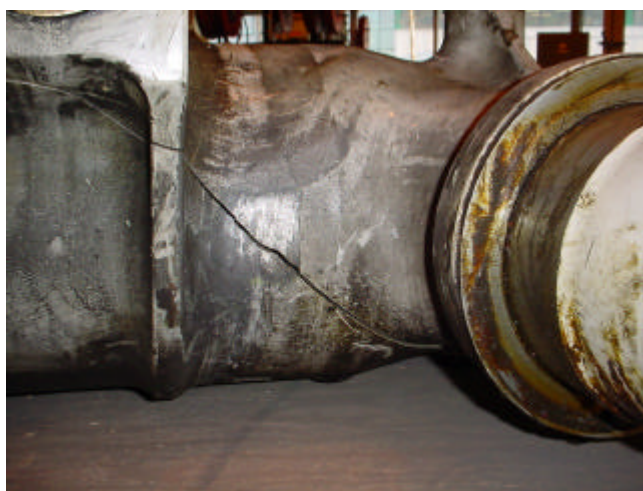
The crack in the right MLG bogie beam